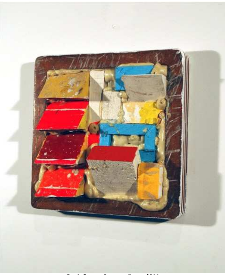
Cordy Ryman, Scaps on Sprap, 2009 Acrylic, enamel, staples and glue on found object (table sample) 12" x 12" x 4"

Forson: Pavel Kraus' white marble piece titled, "Offering/Redemption," (2009) is very much an example of sophistication. How do you separate from its relevance as an eye-catching marble sculpture that fetches for a high-price and also renders itself as a work of art? Art can, and does at times, become a piece of merchandise. How then does it resonate as art?